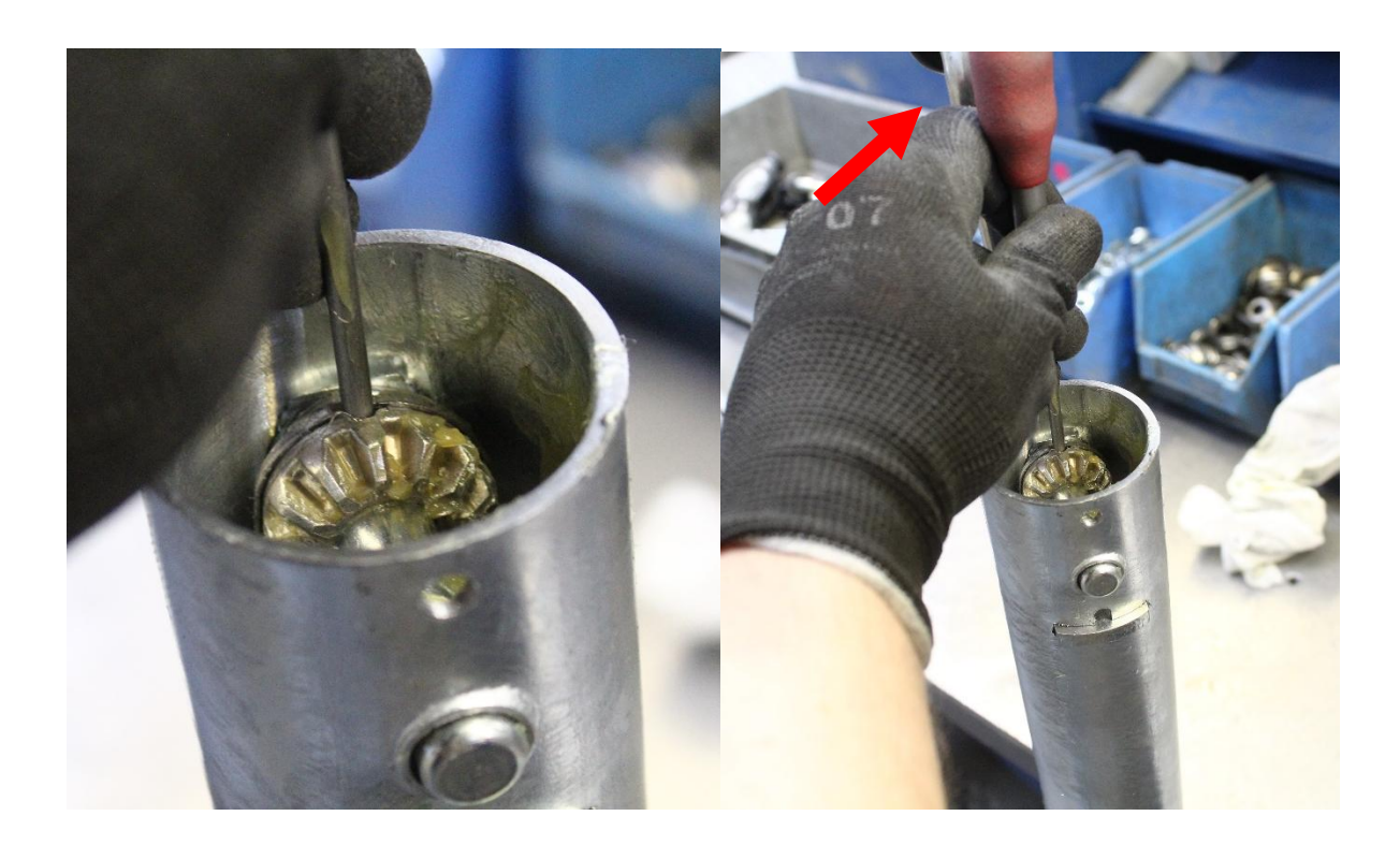
When the pin is exposed rotate the handle to the upright position (shown with the red arrow) then hit the pin with a punch tool to drive it out.